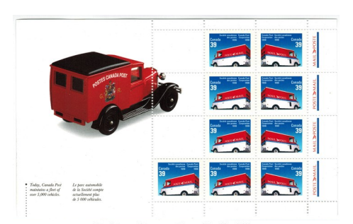
Moving the Mails

As Stamp Collectors, we naturally become interested in the Post Office and their methods of Moving the mail. As Canadians we are familiar with Canada Post's small trucks etc., but it is interesting to see how other countries deal with this issue.